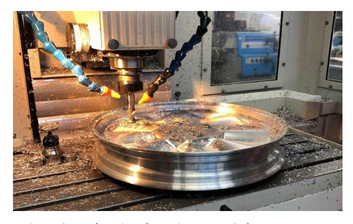
Design and manufacturing of new rims at Fraunhofer LBF

an aluminum alloy (AIMgSi1), in which the new caseless battery system is easily embedded, new rims were also designed and manufactured. The rims come in three different designs: perforated, spoke, and the wave web design. They are all made of aluminum alloy, resulting in further weight reduction of at least 60 percent compared to the original steel rims.